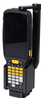
Vehicle Cradle (one body)