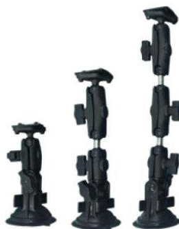
Vehicle Ram Mount (suction / screw type)