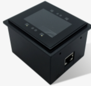
FM3056 Grouper II stationary scanners